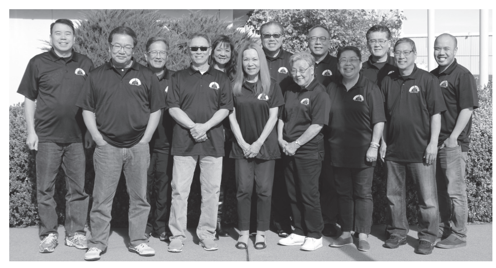
The Sacramento Asian Sports Foundation Board met January 31, 2016 to discuss the goals for the coming year. Phase II options were discussed in depth.