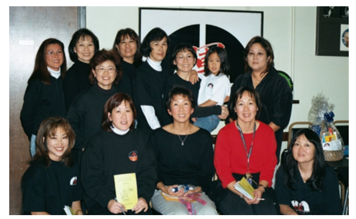
Silent Auction Committee in 2000