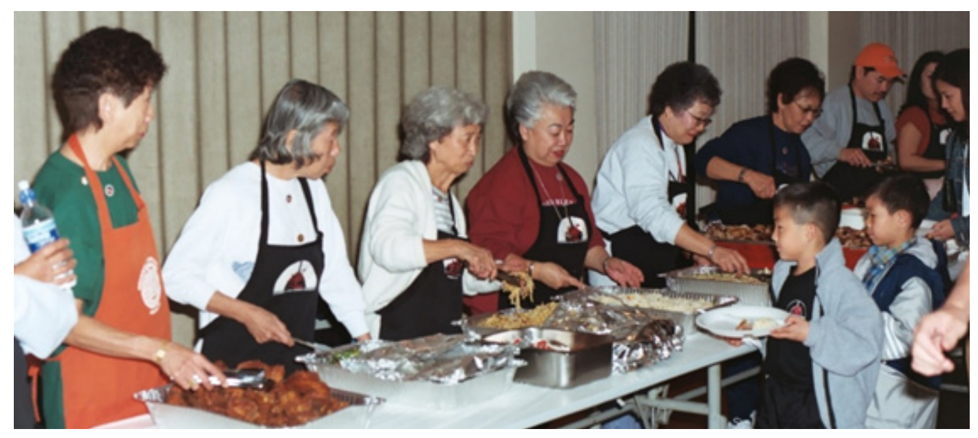
Serving attendees at our Social