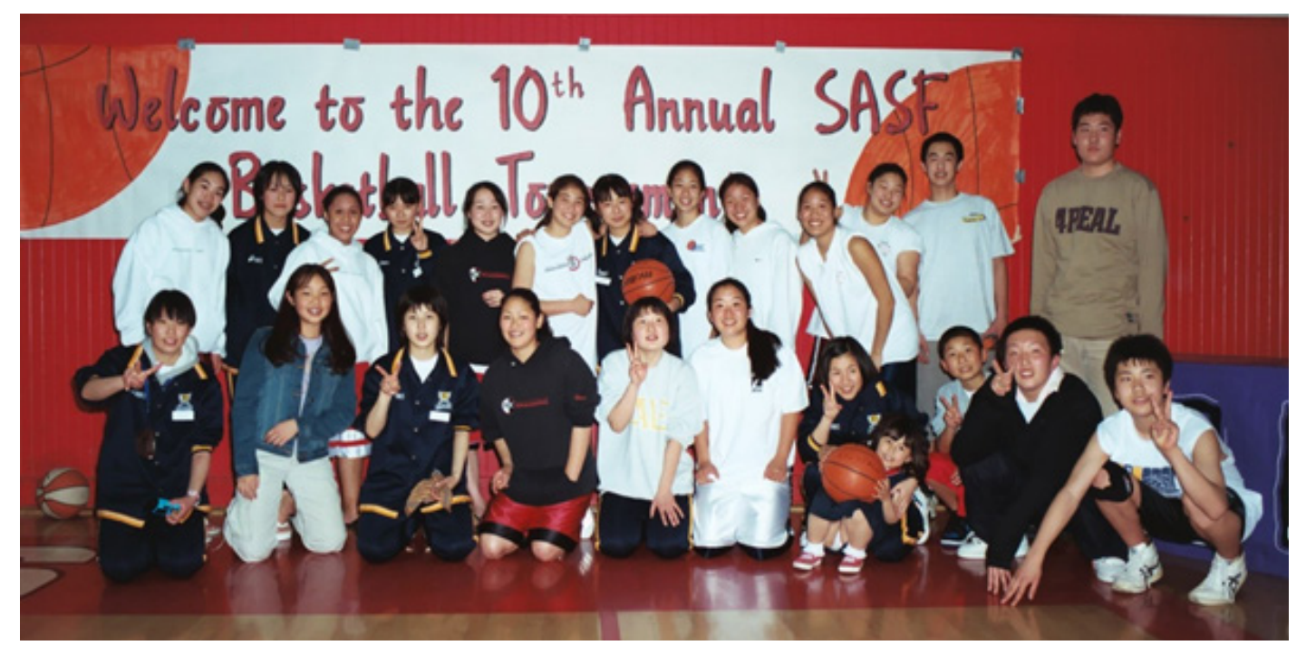
Sacramento players greet teams from Matsuyama Japan at the Opening Night of the 10th Annual SASF New Year's Classic Invitational Basketball Tournament in 2003

Our tournament goal was to provide a fair and competitive environment for all teams and to promote good sportsmanship. Our success was measured by the lifelong friendships created. Our participants learned the value of teamwork and good sportsmanship through competition. The tournament also included a sell-out teen dance at the Hilton Hotel. The younger participants