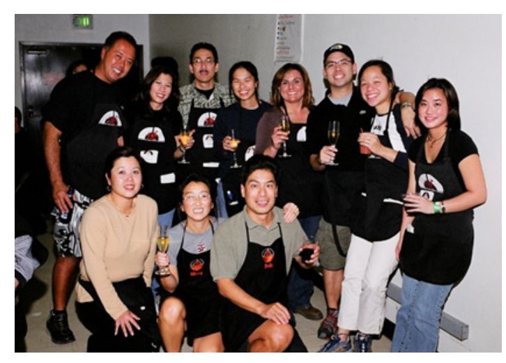
2004 Crab Feed Servers